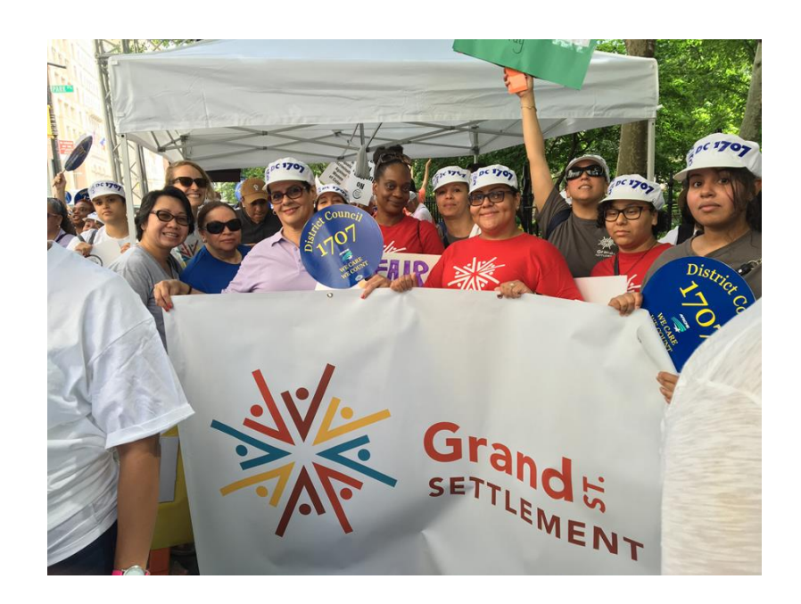
We marched at City Hall to call for salary parity for our early childhood educators!